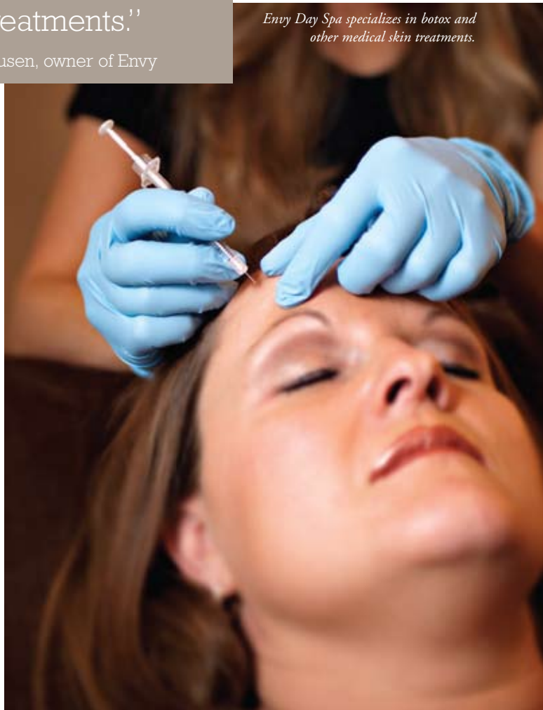
Envy Day Spa specializes in botox and other medical skin treatments.